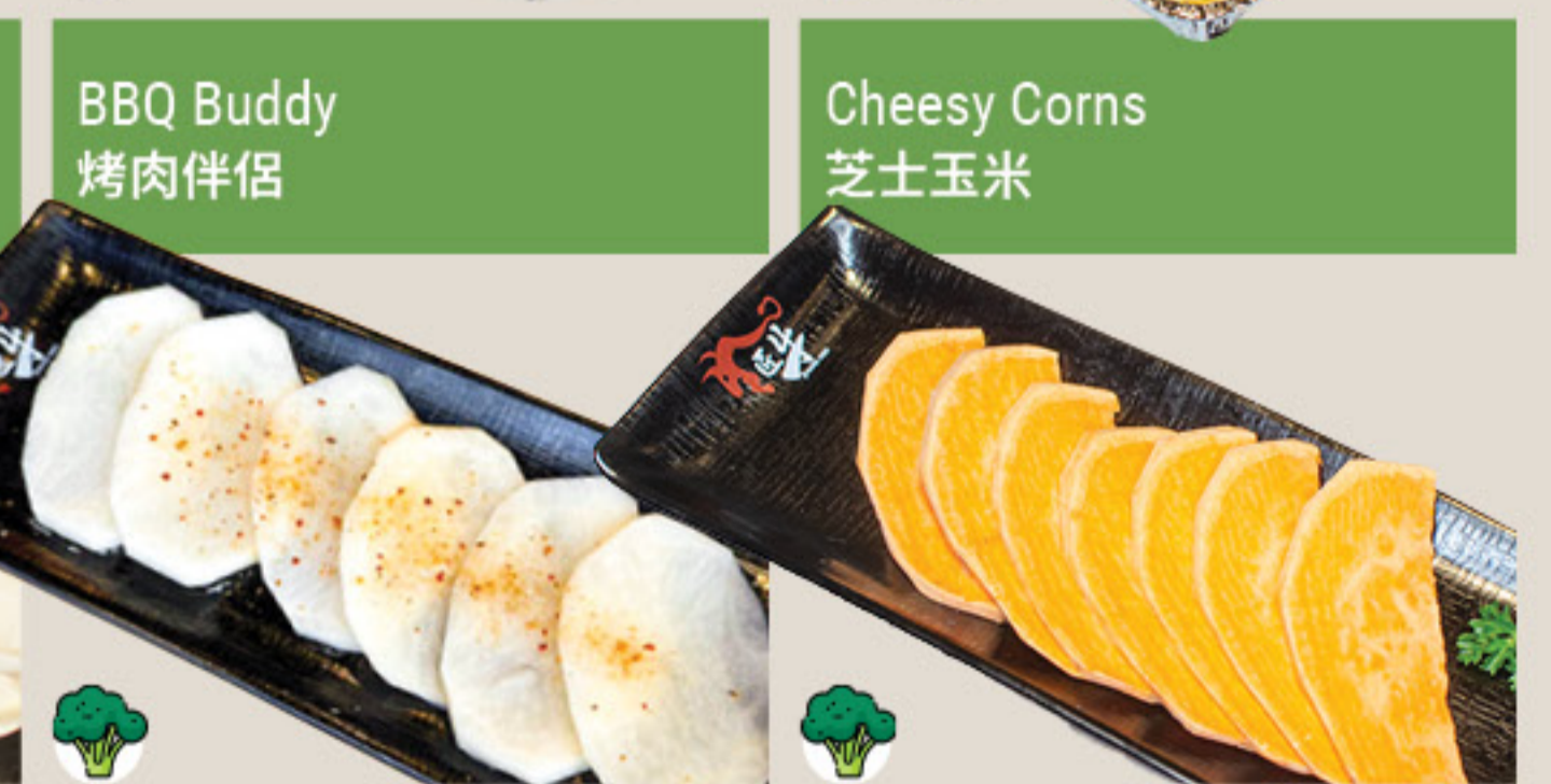
Potato Slices 土豆片