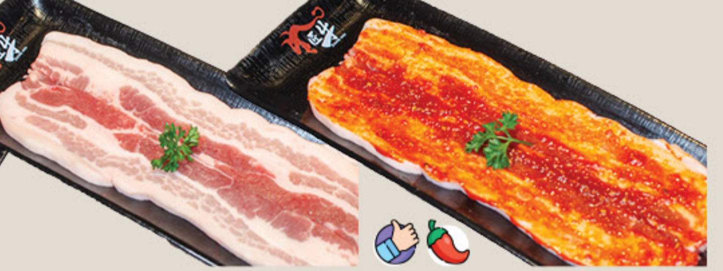
Premium Pork Belly 原味豬五花