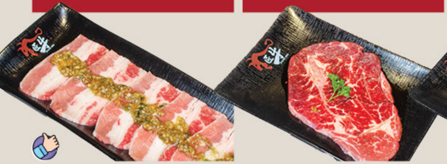
Garlic Beef Slices 蒜香肥牛