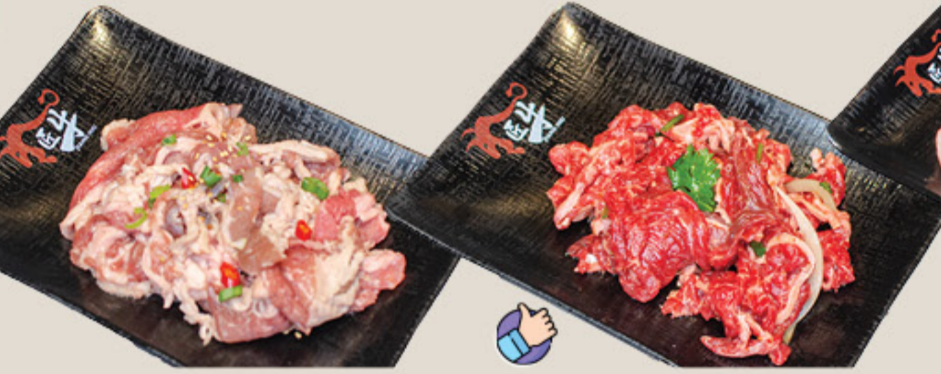
House Marinated Beef 老味肥牛