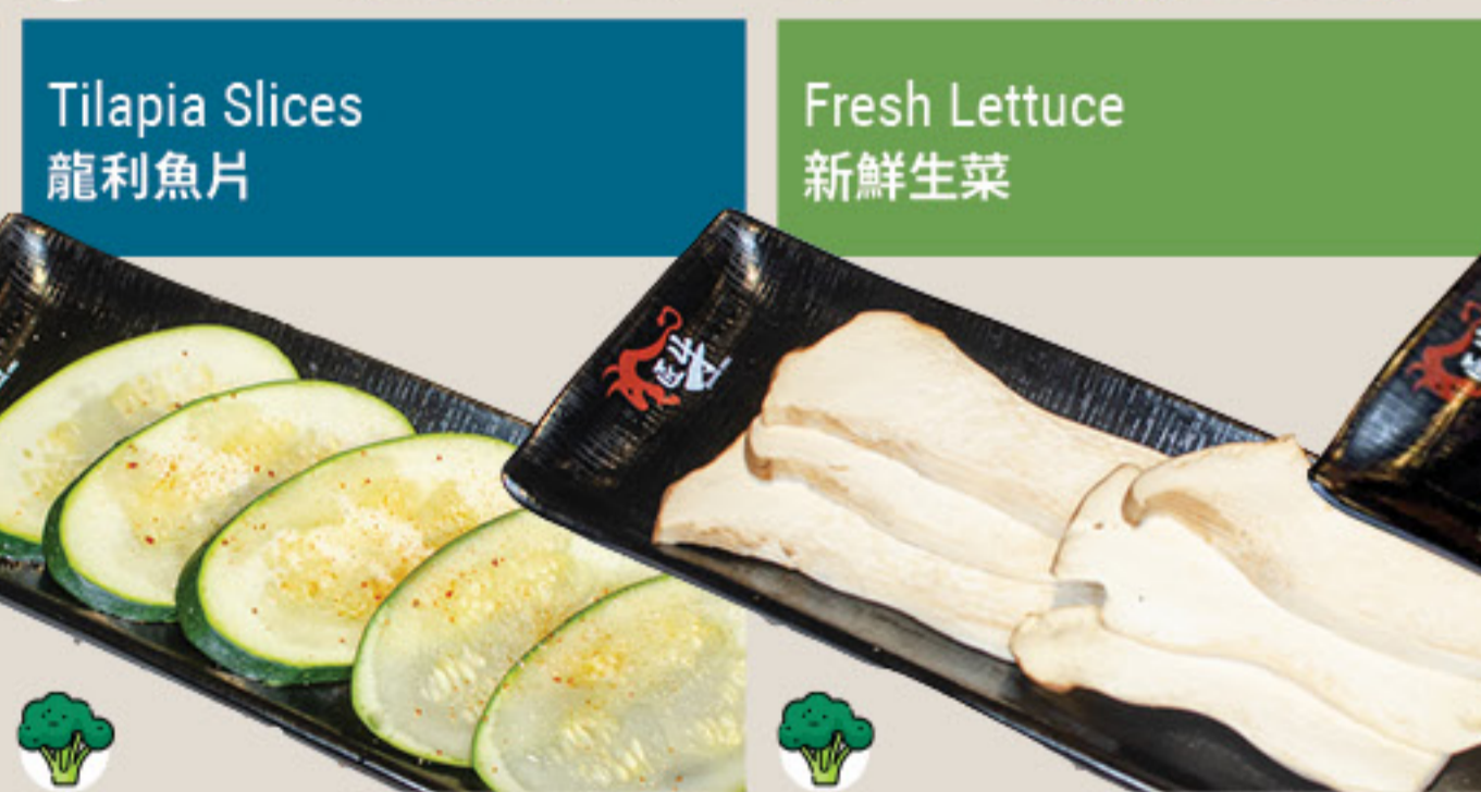
Zucchini Slices 西葫蘆片