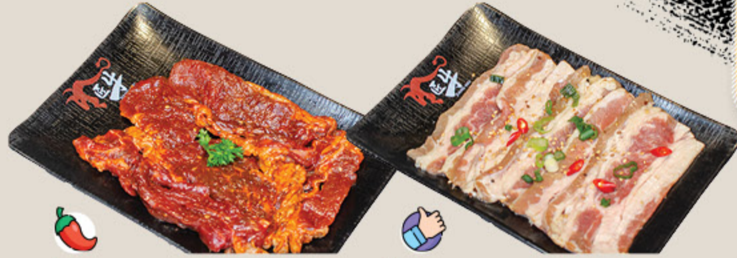
Black Pepper Steak 黑椒牛排

BIRTHDAY PERSON WITH A VALID ID GETS ONE FREE AYCE DEAL ON THE SAME DAY OF THE BIRTHDAY 壽星於生日當日憑有效證件，可享用一次免費 ALL YOU CAN EAT DEAL