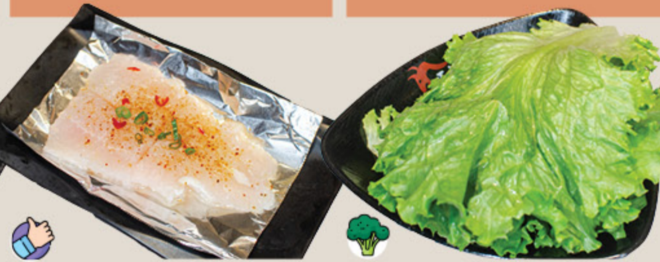
Tilapia Slices 龍利魚片