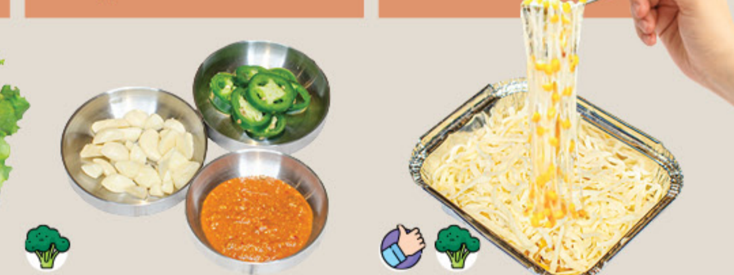
BBQ Buddy 烤肉伴侶