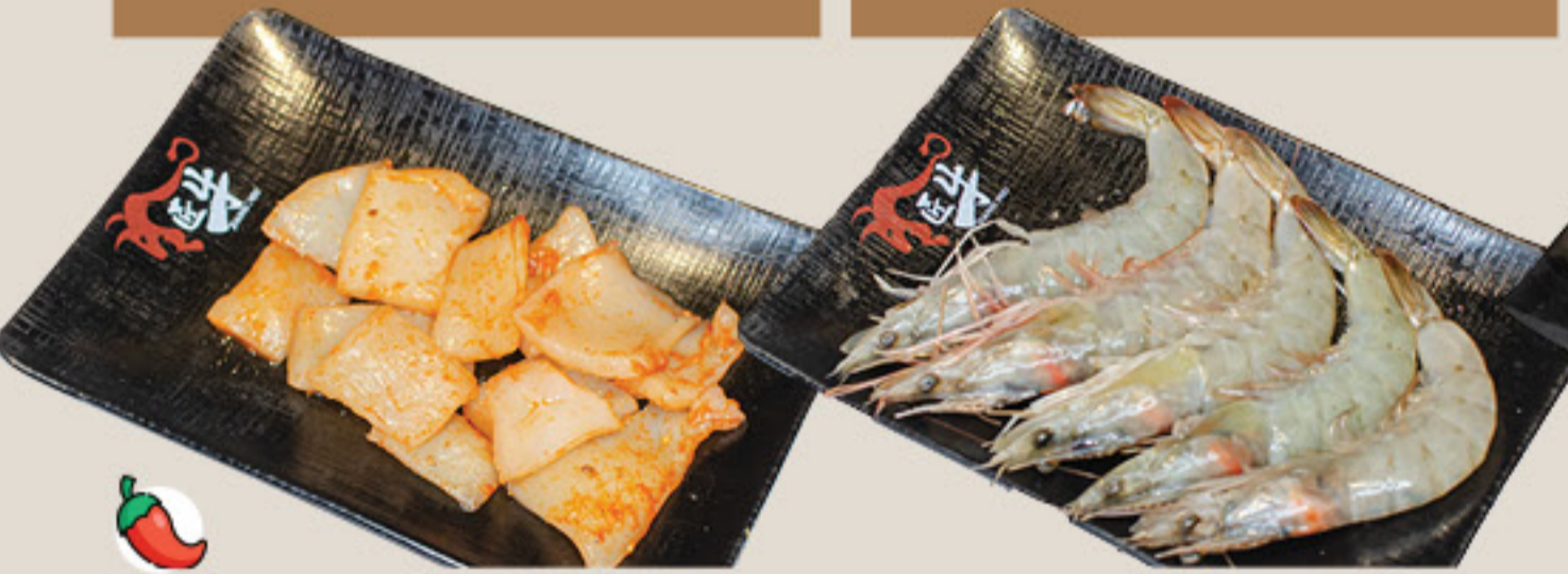
Spicy Squid 辣味魷魚